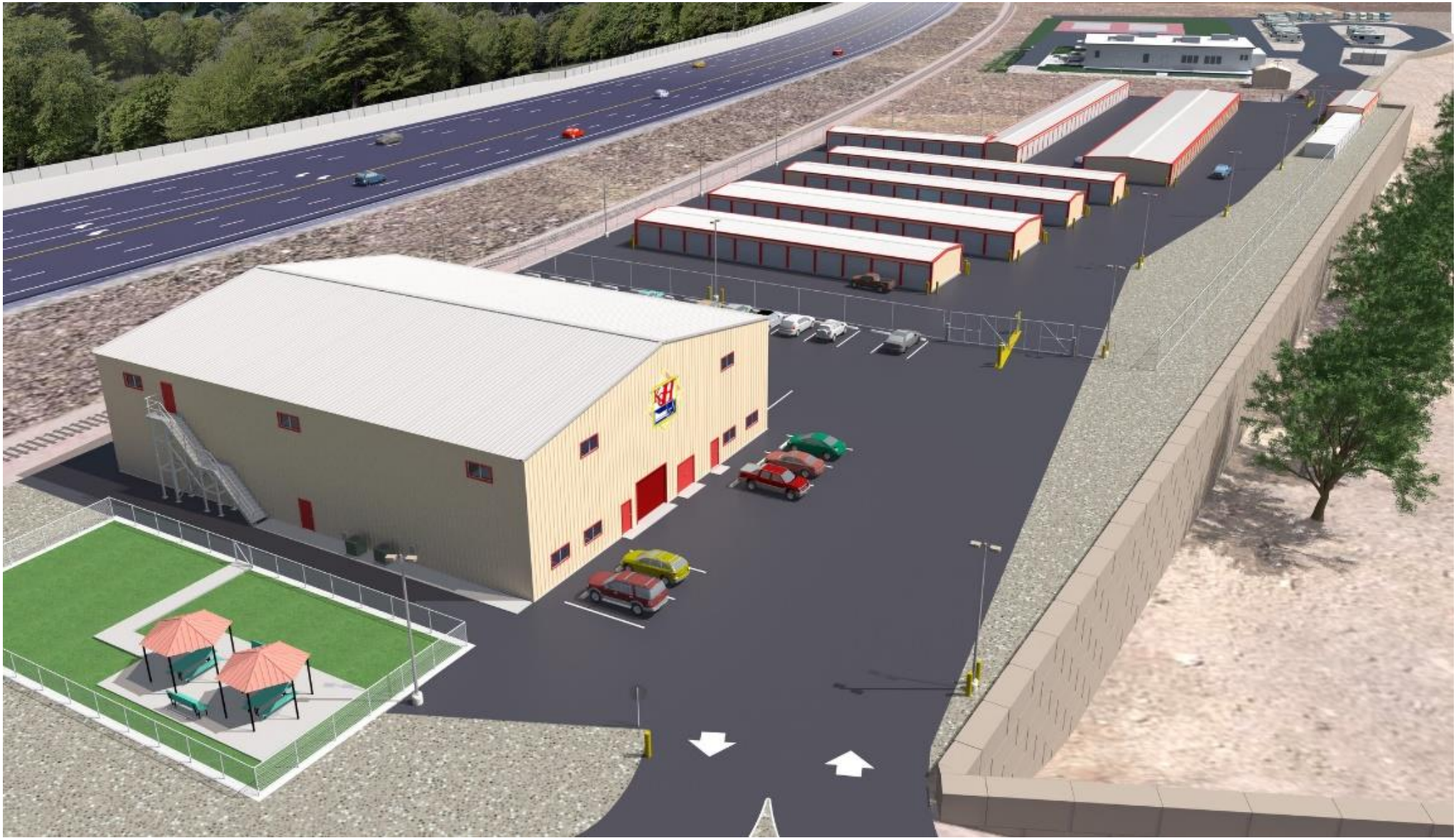
Corner of Van Giesen and Bypass