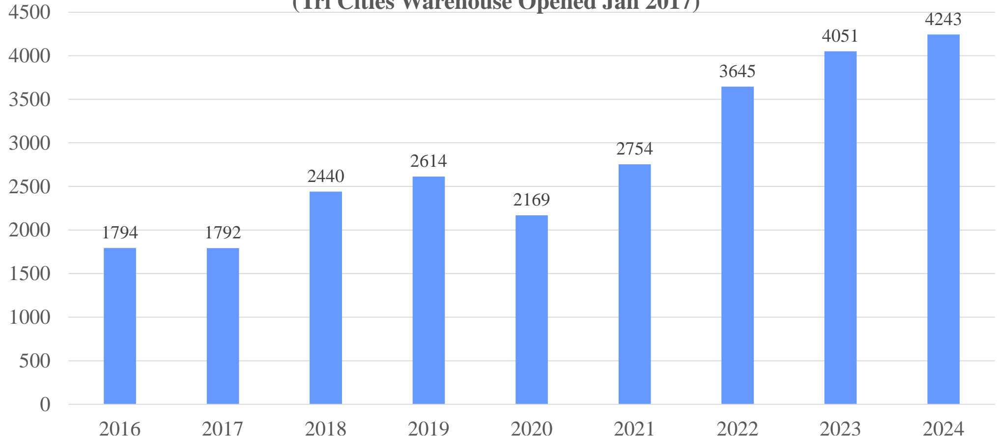
Tri Cities Equipment Items Issued 2016 through 2024 (Tri Cities Warehouse Opened Jan 2017)